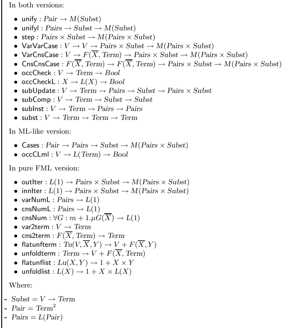
Fig. 7. Types of the functions used in the unification algorithm

cursive definitions of polymorphic expressions, and polytypic definitions. These extensions will be embodied in \text{FML}_{poly} in Section 6.3.